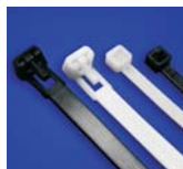
Releasable Cable Ties

ACT ADVANCED CABLE TIES, INC. 245 Suffolk Lane, Gardner, MA 01440 Phone: 800.861.7228 - Fax: 978.630.3999 sales@actfs.com